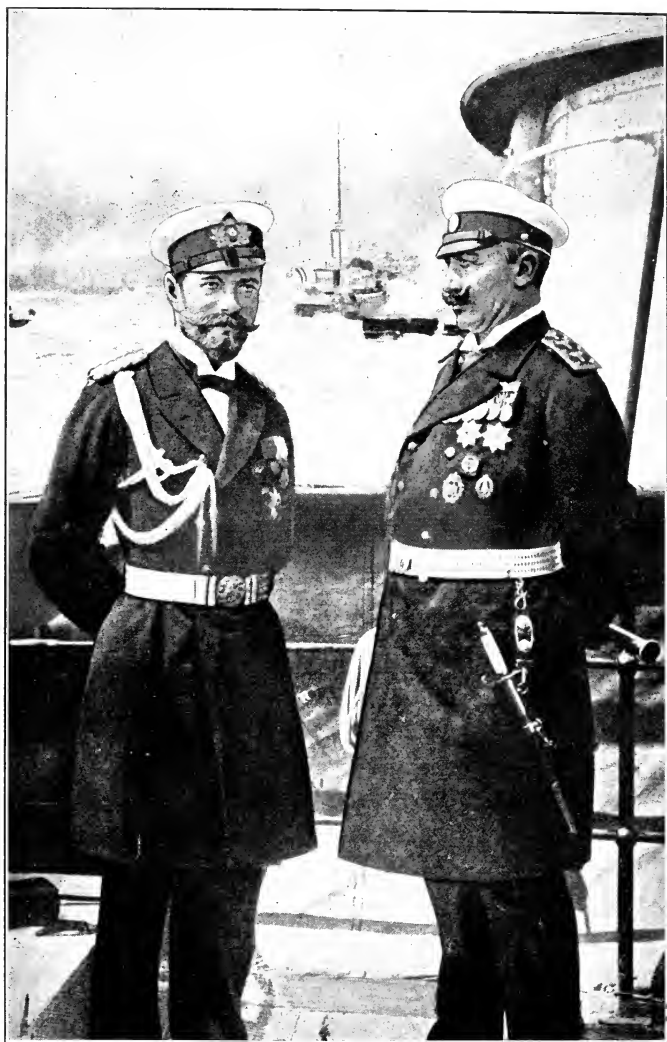
KAISER AND CZAR ABOARD THE "HOHENZOLLERN"

The weak Czar was often tricked by the Kaiser when accepting his hospitality, and many matters of state were settled (to the Kaiser's advantage) aboard the Kaiser's yacht.