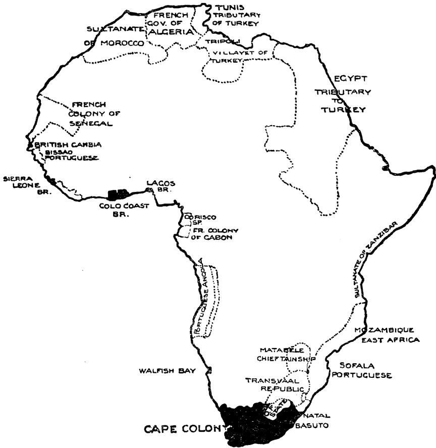
BRITISH AFRICA IN 1873.