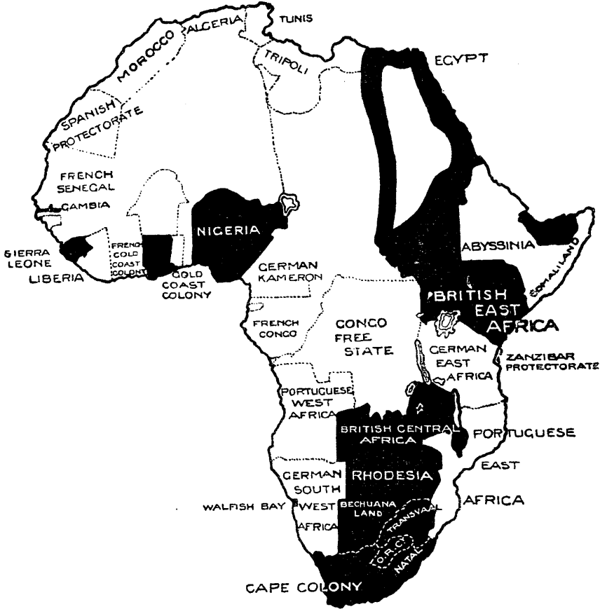
BRITISH AFRICA IN 1902.